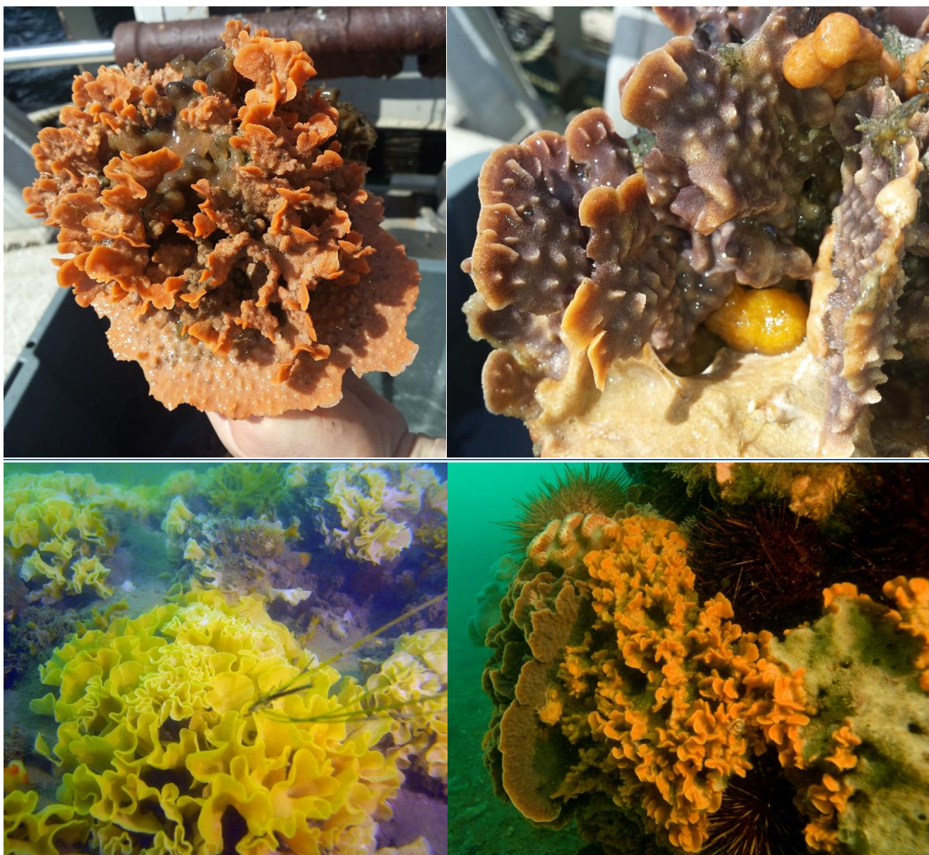
Figure 1. An assortment of different species of Bryozoans that can be found in Western Port, including colonies growing on the PoHDA pier!